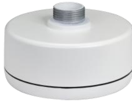
Junction Box IBBCEM-134